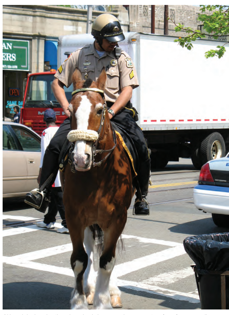
Although in Jamaica there has clearly been growing momentum for reform, as well as a great deal of external support, the anti-corruption process is far from complete and will take some time.

Pate, D., 'Who Killed Kingfish?', The Gleaner, (1 July 2012), http://jamaica-gleaner.com/gleaner/20120701/news/ news1.html.