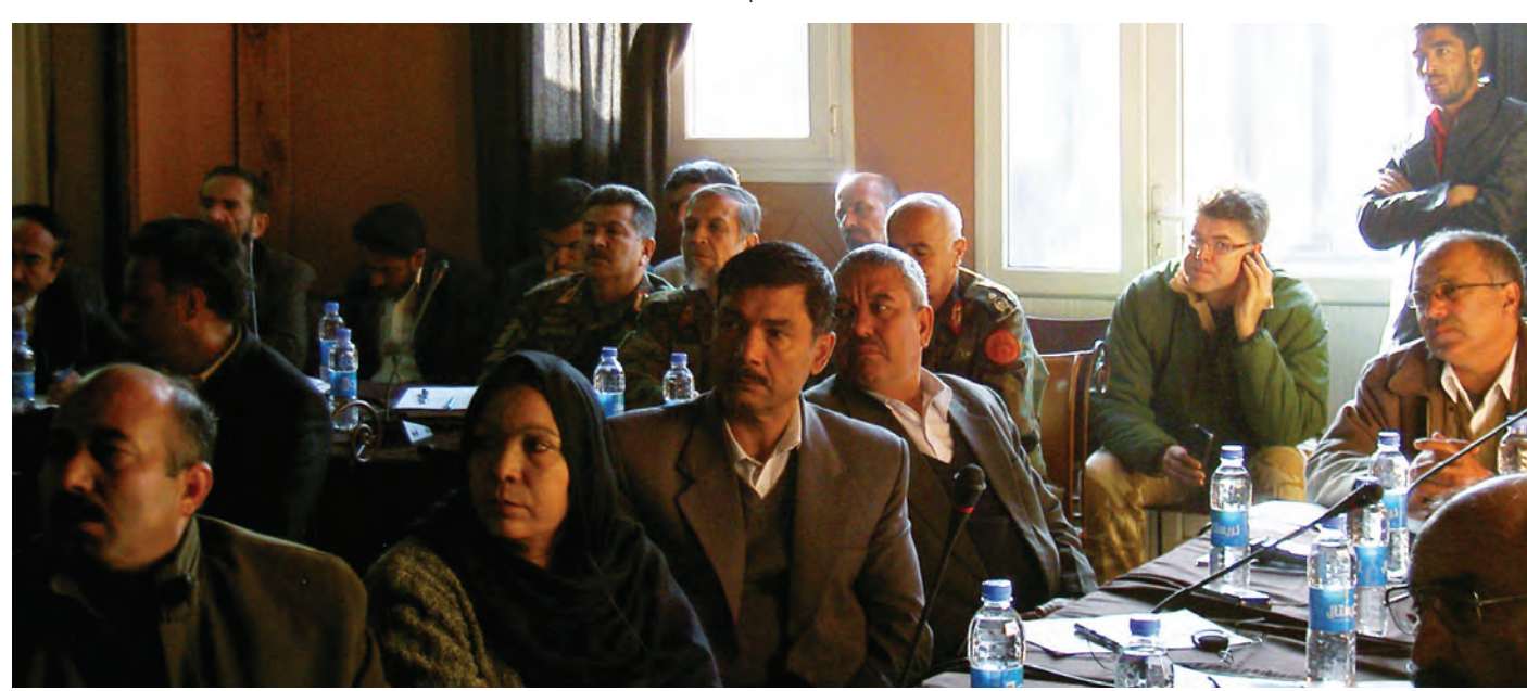
Senior Afghan Officials in one of the modules of our Building Integrity course in Kabul.

Transparency International National Chapters and related organisations around the world also have experience of working on police corruption. In countries as diverse as Russia, Sri Lanka, Jamaica, the UK and Venezuela, Transparency International National Chapters have been advocating for domestic law enforce institutions to become more transparent and accountable.