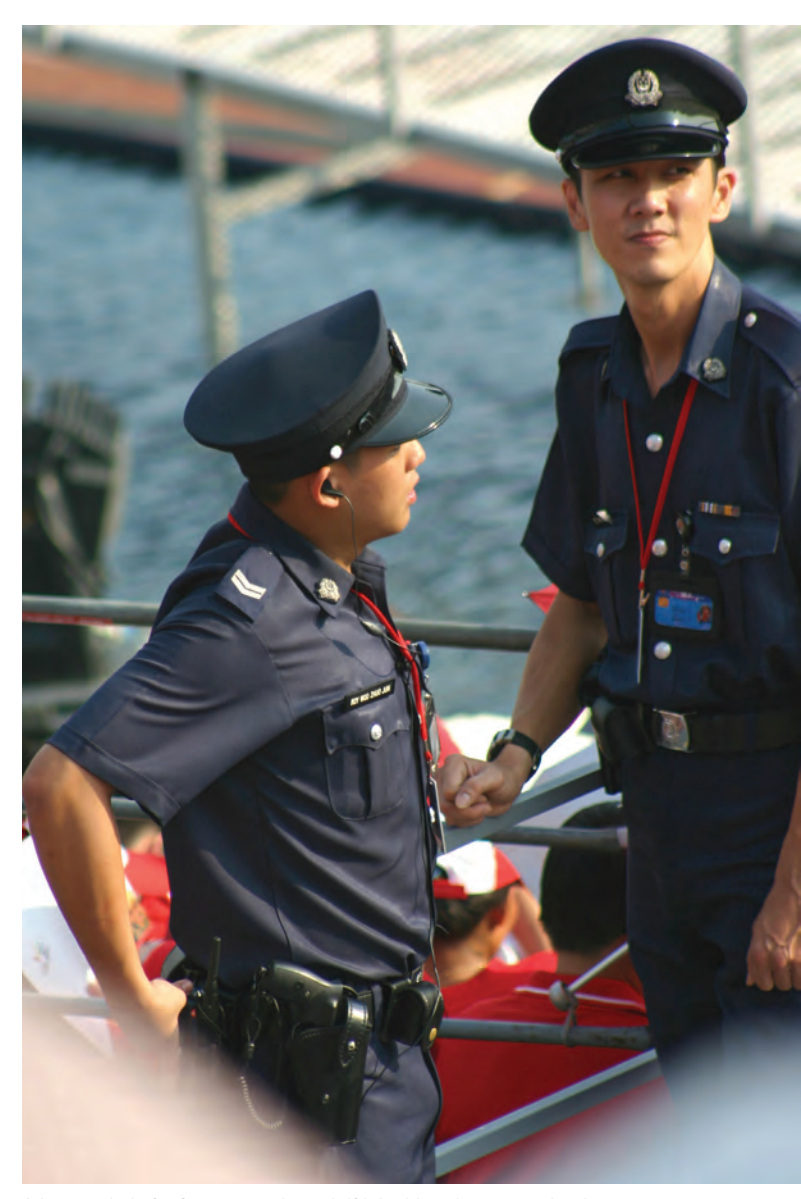
A long period of reform can only work if it is driven by a committed and pro-active government, as has been witnessed in Singapore.

J. Quah, Preventing Police Corruption in Singapore (2006), p.65.