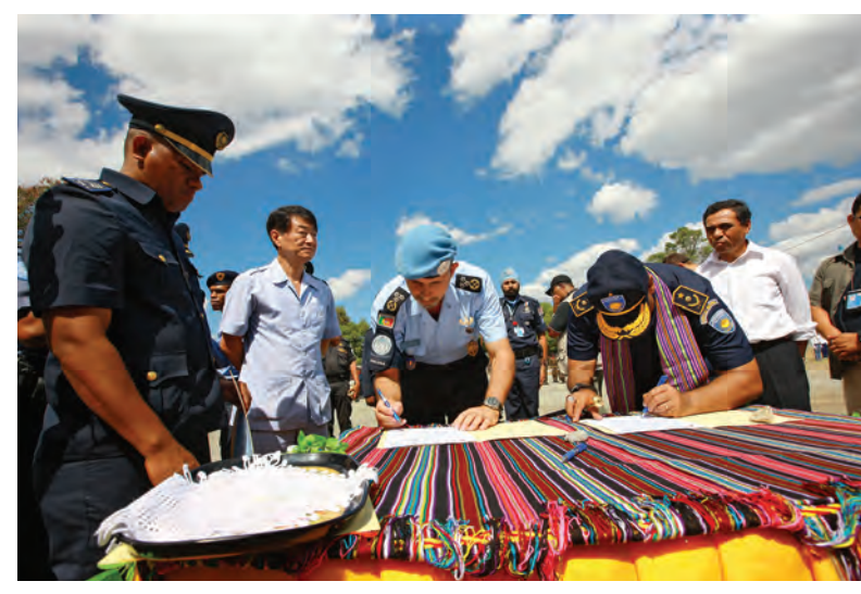
Anti-corruption reforms will have a much greater chance of success if the ability to monitor them is opened out to the wider public for it is through transparency that the opportunity and temptation for corruption diminishes.