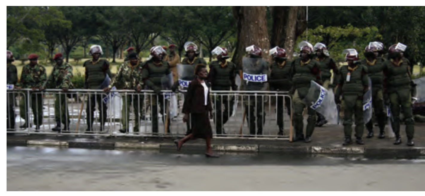
With sustained and determined reforms, the Kenyan Police could become a truly protective force. Yet for this to happen, reforms must be backed up with total commitment by the next Kenyan government.

After 15 months of a new training programme, hundreds of new police recruits are due to graduate in time to 'supplement the police population ahead of the 2012 General Election'. 255