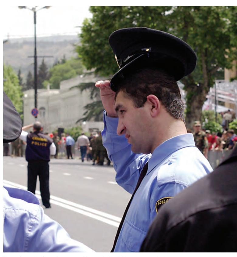
The reforms in Georgia are positive and should be commended. The speed and immediate efficacy of early efforts increased public confidence in the country's law enforcement. However, further reforms are necessary to reduce institutional corruption and maintain the public's trust in the Georgian National Police.

CMI, U4 Practice Insight: Police Reform in Georgia 173 (2010), p.4.