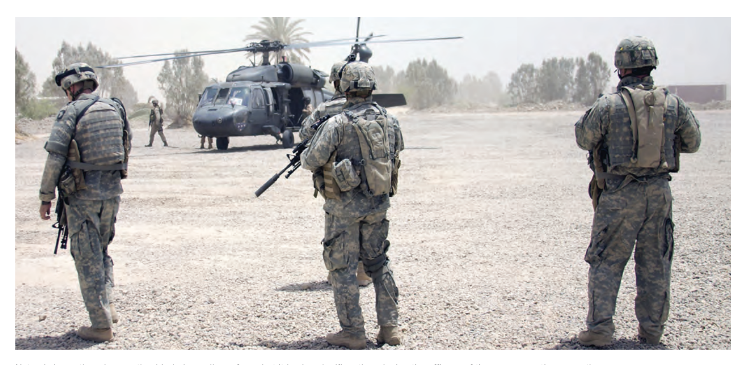
Not only is continued corruption hindering police reform, but it is also significantly reducing the efficacy of the government's war on the Taliban.

A recent report98 concludes that despite the huge sums of money invested in the police since 2007, it remains the general perception amongst citizens that the police are intrinsically corrupt: a view reinforced by frequent, negative dealings with them in person. It is even suggested that this is driving citizens to support the Taliban, who are able to portray themselves as a better alternative to a corrupt police force influenced by the international community.