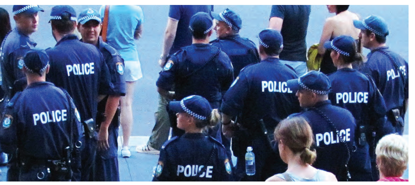
The Wood Commission suggested the establishment of a single agency to monitor police conduct, which should be independent of the police force and hold sufficient coercive powers to investigate corruption. The Police Integrity Commission was established in 1996 on the basis of this suggestion, and continues to operate today.

There were also concerted efforts to integrate 'ethics and integrity'113 into a new training programme, developed jointly by the Employee Management Branch and the Special Crime and Internal Affairs, that included innovative guidance on internal grievances policies, conflicts of interest, and the process of internal investigations. 114