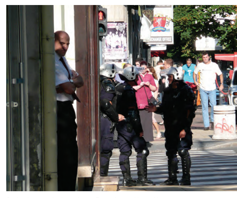
Regional cooperation in south-east Europe is a positive tool in the fight against corruption, and the exchange of information and expertise between Serbia and its neighbours should be encouraged. .

Tanjug, 'Serbia and Montenegro Sign Agreement in Police Cooperation', Flare Network, 25 March 2011, retrieved June 2012, http://flarenetwork.org/learn/project_echo/croatia/ article/serbia_and_montenegro_sign_agreement_on_police_ cooperation.htm.